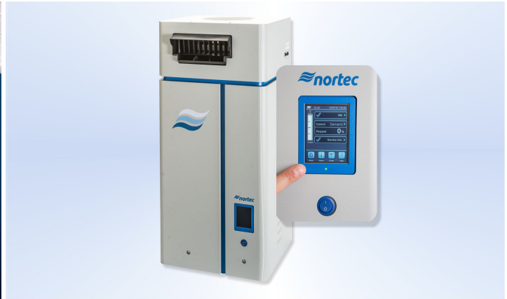
EL Series Electrode Steam Humidifier

As the leading manufacturer of commercial/industrial humidification systems for more than 40 years, Nortec has the technology and application expertise to meet the needs of any application.