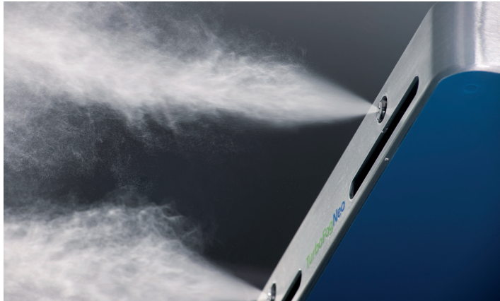
Draabe Series TurboFogNeo High Pressure Humidifier