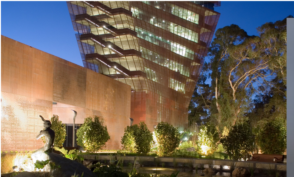
Above: Golden Gate Park and de Young Museum, San Francisco

System solution makes underground parking garage undetectable in urban park