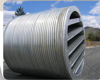
Above System solution for underground ventilation system

This system solution helped the design and construction teams meet all system requirements, thereby allowing the garage to obtain an occupancy permit to open for use.