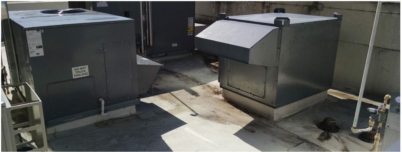
Rooftop units of the Hilton Garden Inn's HVAC system