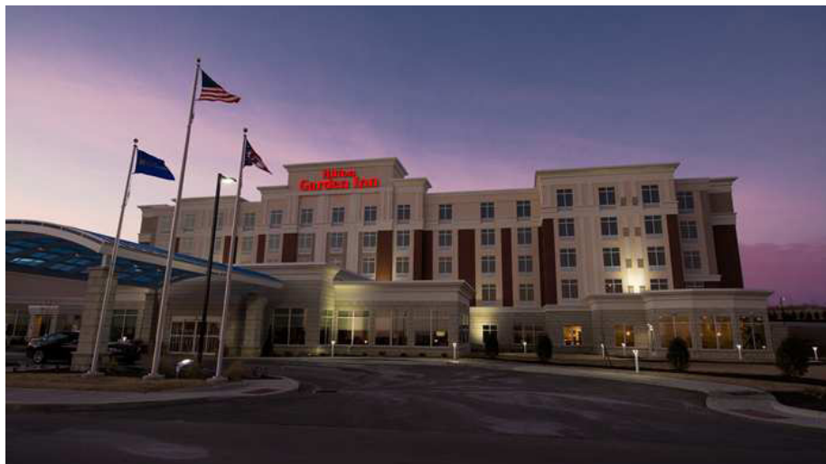
RenewAire ERVs reduced the annual HVAC energy use by 34% at the Hilton Garden Inn located in Dayton South/Austin Landing, Ohio

Although better ventilation is the best way to enhance IAQ, many building owners — particularly of commercial and multifamily structures — are wary of additional costs that might be incurred. However, those days are in the past as Energy Recovery Ventilation (ERV) systems now operate energy-efficiently and cost-effectively while providing clean, healthy indoor air and generating major energy savings. How is this possible? By reducing heating and cooling loads.